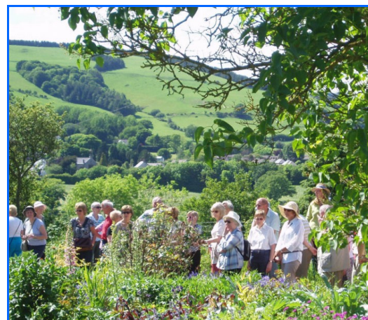
Gardening Group at Maeshafn